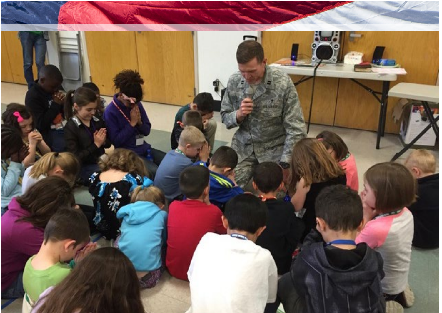
Chaplain prays with Good News Club children at Joint Base Elmendorf Richardson, Alaska