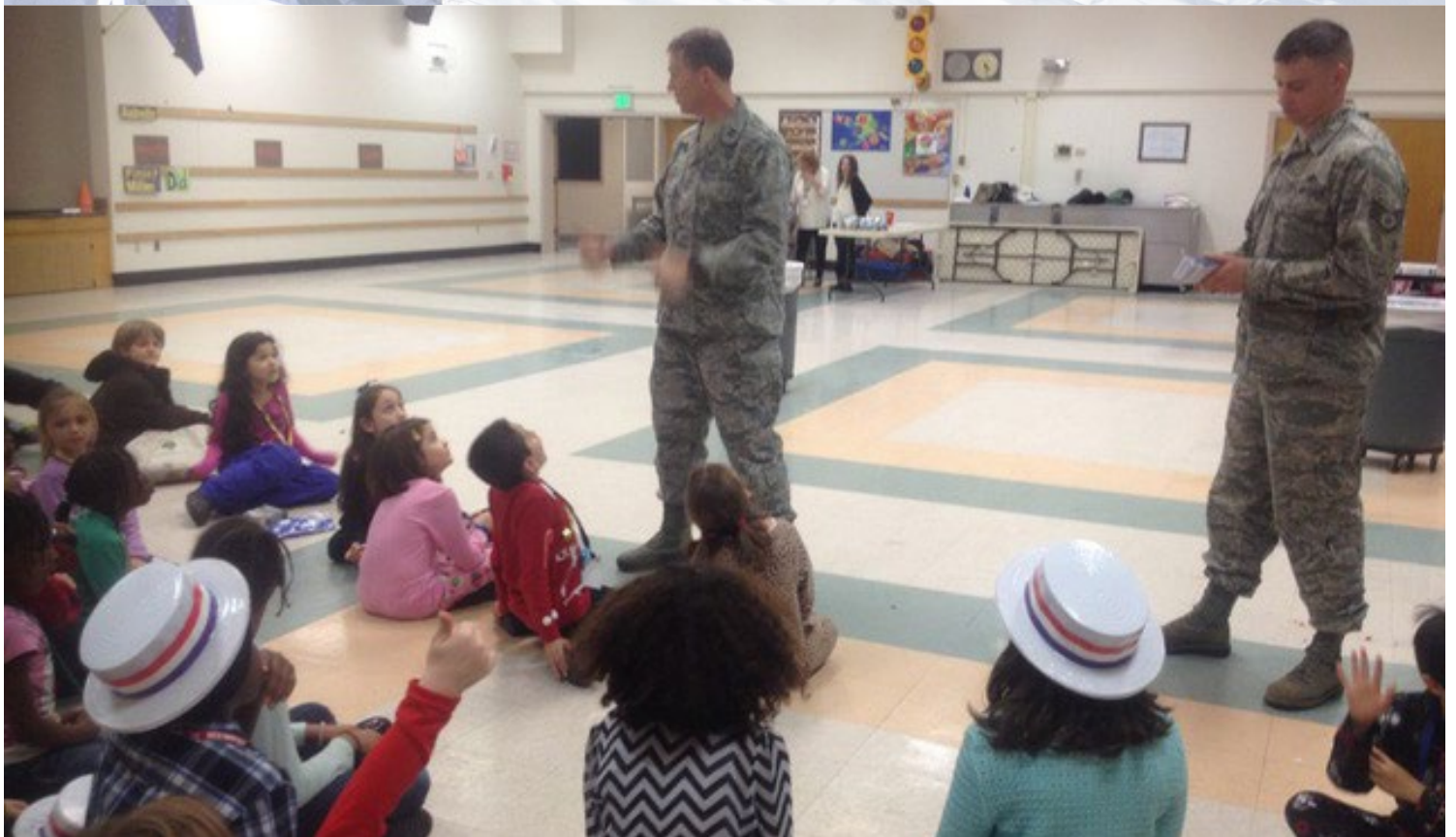
Chaplains visit Good News Club at Joint Base Elmendorf Richardson, Alaska