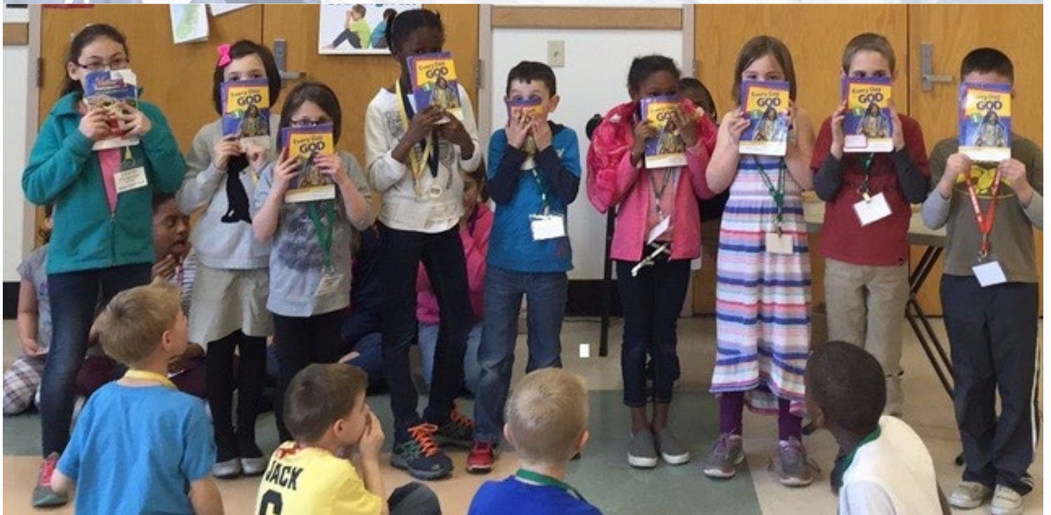
At Good News Club on Joint Base Lewis-McCord, Washington children receive Every Day with God devotional books and learn to spend time with God every day.