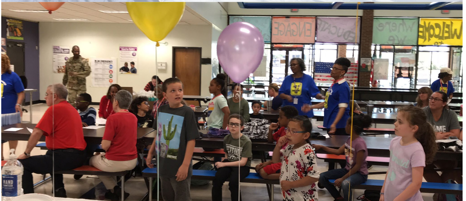
Good News Club on Ft. Jackson Army Base, South Carolina