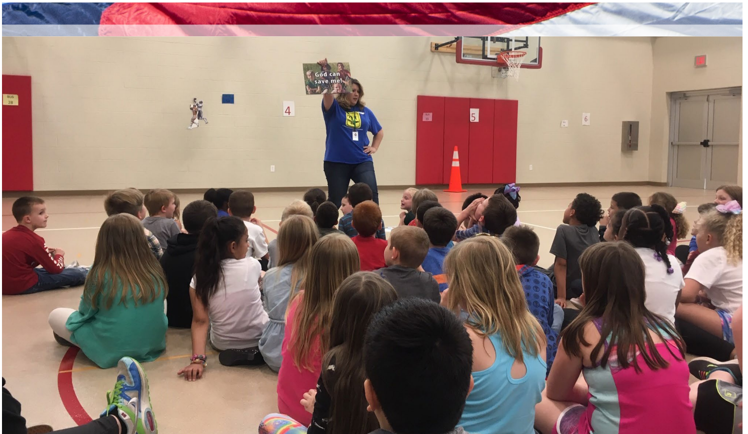
Children from 101st Airborne Division, Ft. Campbell, Kentucky learn Word Up! truth at club