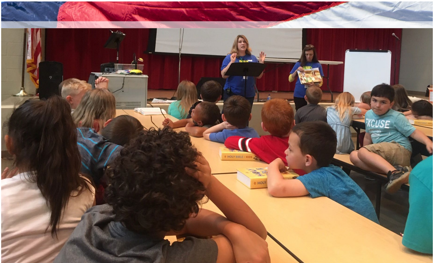
Children from 101st Airborne Division, Ft. Campbell, Kentucky listen to Bible lesson